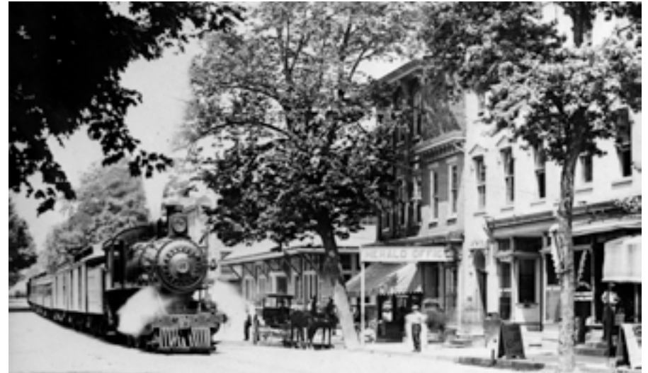
The Carlisle “train station,” circa 1907.